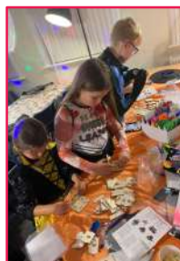
Drama Class With Secondary Group